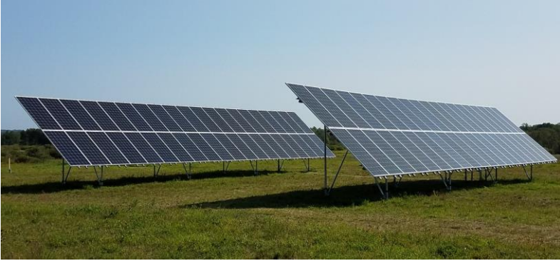
Detroit Lakes Public Utility's 29.3 kW Select Solar Community Solar Garden Detroit Lakes, MN