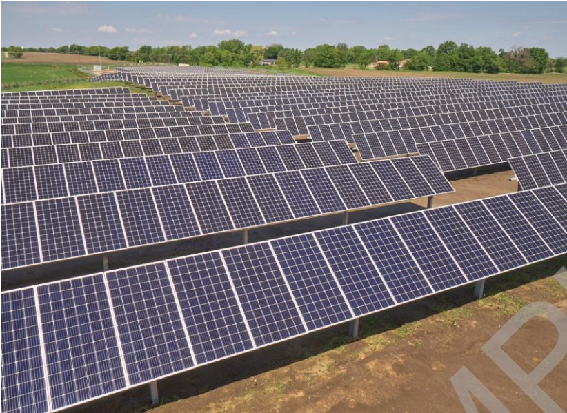
Minnesota Municipal Power Agency's 7 MW Buffalo Solar Buffalo, MN